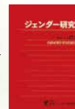
Annual journal, Gender Kenkyu (Gender Studies)